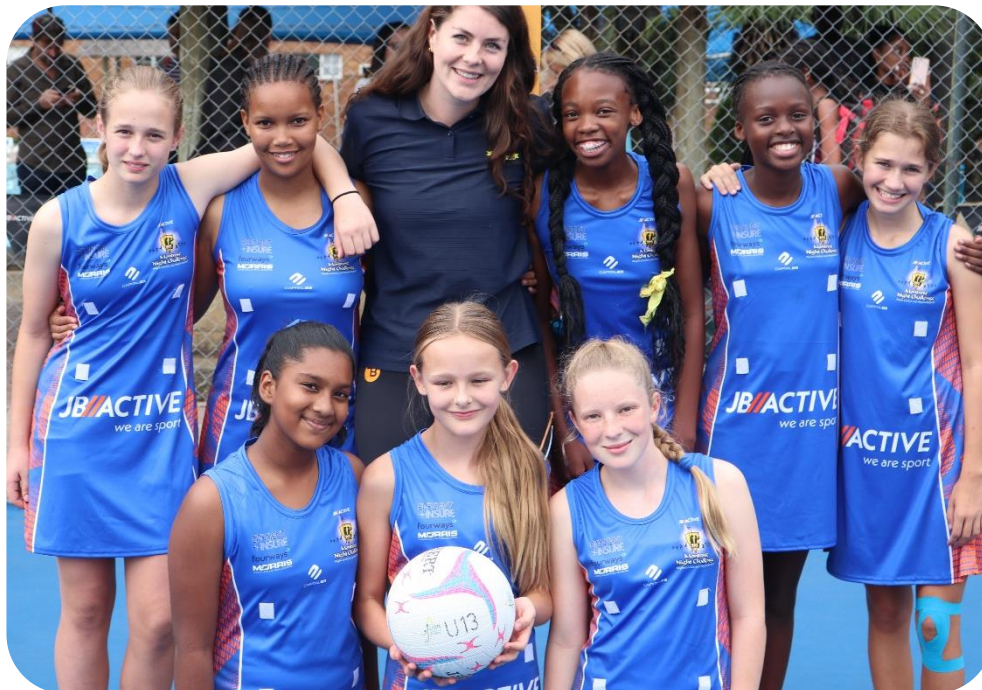
The Open Netball team