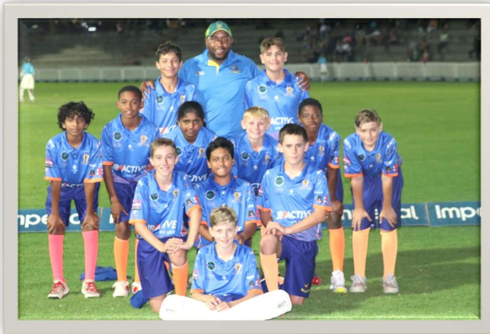
The Open Cricket Team