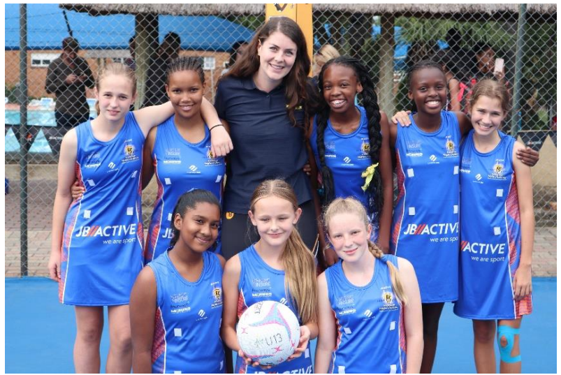
Open Netball Team

Ramadan Mubarak: We wish all our Muslim families and staff members 'Ramadan Mubarak' (Ramadan Greetings/Best Wishes) as their month of fasting begins next week. This month is regarded as one of the holiest in the Muslim calendar which is based on the Lunar Calendar (months begin and end with the sighting of the new moon). During the entire month of Ramadan, Muslims fast every day from dawn to sunset (no liquids or food is consumed). It is meant to be a time of spiritual discipline - of deep contemplation of one's relationship with the Almighty, extra prayer, increased charity and generosity, and intense study/recitation of the Quran (the holy book of the Muslims).