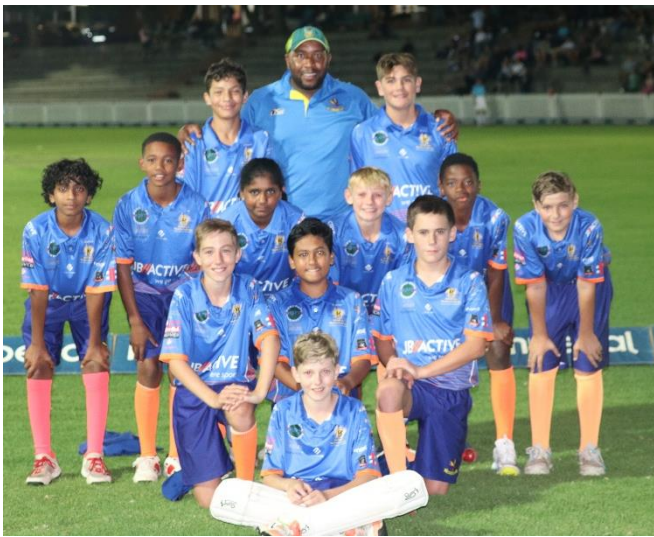
Open Cricket Team