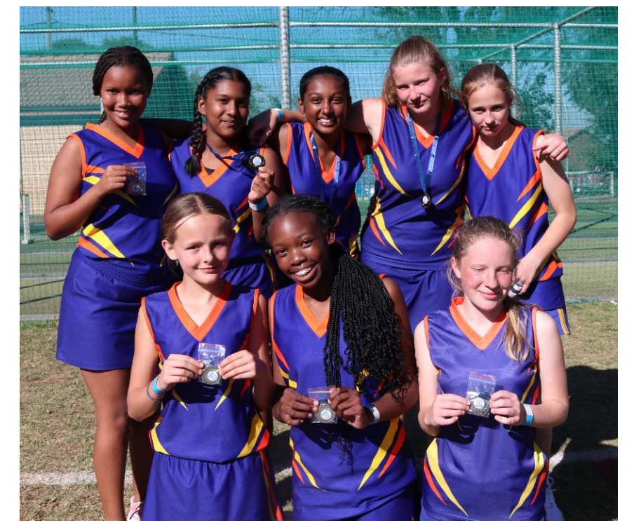
Under 13 A Silver Medals