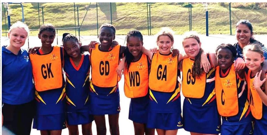
The Under 12 Netball team