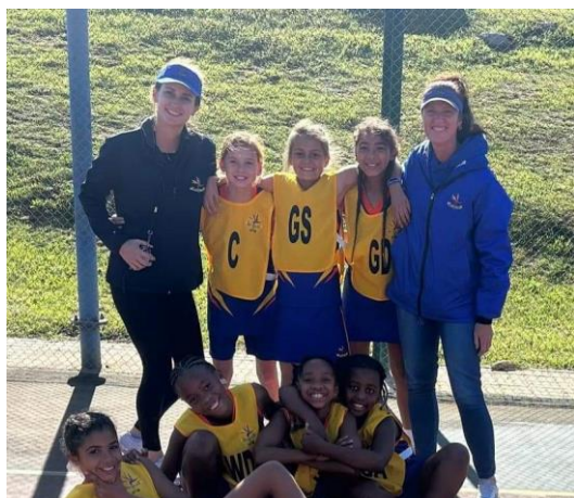
The Under 10 Netball team

Last year we had only one team that progressed to the District Finals. This year we had 3 teams making it to the District rounds. Our U13 Netball team progressed to the quarter-final stage and we are very proud of our U10 and U12 Netball teams for making it to the Finals of the District Championships.