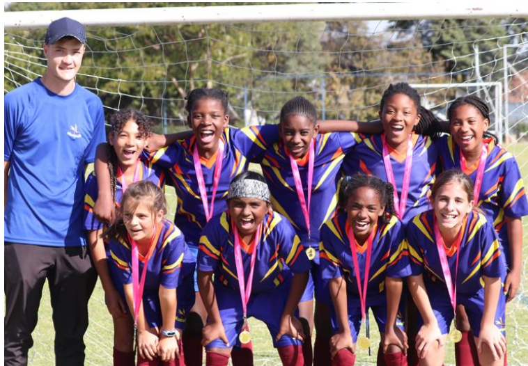
The Under 11 Winners

Last week Saturday, 3 June 2023. Our U11 and U14 Girl's soccer teams participated in the Bryandale Primary Girls Soccer Tournament. The girls played against teams from 3 other schools with a gruelling 20 mins a match. Over 5/6 rounds of matches were played – some even being played one directly after another. Both our girls' teams certainly showed their mettle either winning or drawing their round robin matches to qualify for the semi-final and then the finals with both matches consisting of two halves of 15 mins each way. In total the girls played over 180 mins of soccer which is equal to two full 90 min games – all on the same morning. It gave all in attendance great pleasure to see the quality of football demonstrated by our girls' teams and was made even sweeter with both the U11 and the U14 girls winning their age divisions. Bryneven was also awarded the 'Best Girls Soccer School' Trophy along with 3 of our girls winning individual soccer awards. Well done to both set of players and their coaches and thank you to the parents who came to support our talented teams.