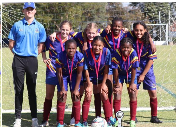
The Under 14 Winners