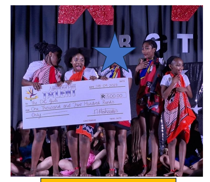
DC Girls Intersen Phase Winners