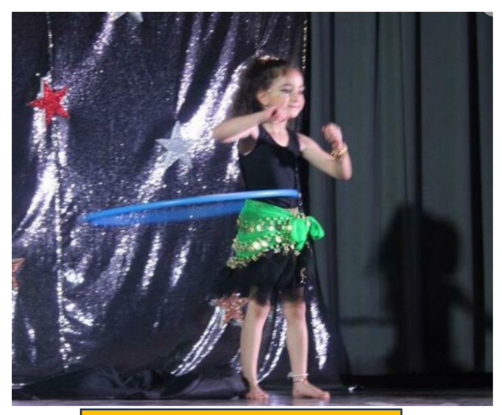
Chloe-Rita Saad Foundation Phase Winner