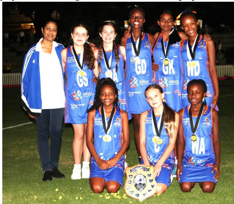
The Bryneven Open Netball Team